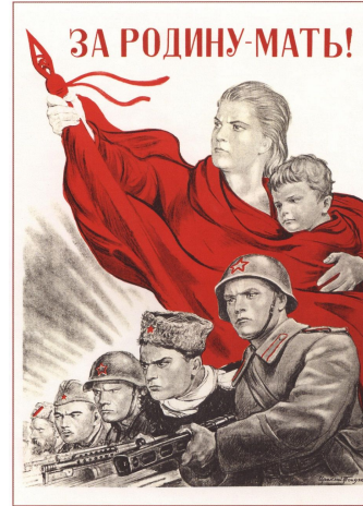
“for the motherland”