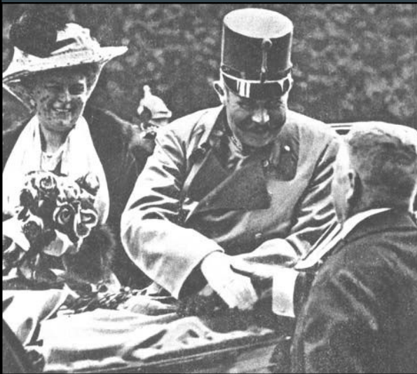
Archduke Franz Ferdinand and Duchess Sophie at Sarajevo, Bosnia, on June 28 th , 1914.