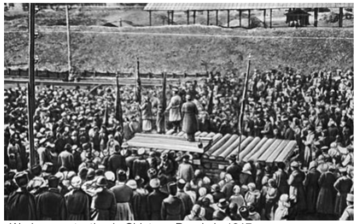
Workers protesting in Chiatura, Russia in 1917.

In 1903, Russian Marxists split into two groups over revolutionary tactics. The Mensheviks wanted a broad base of popular support for the revolution. The Bolsheviks supported a small number of committed revolutionaries willing to sacrifice everything for radical change.