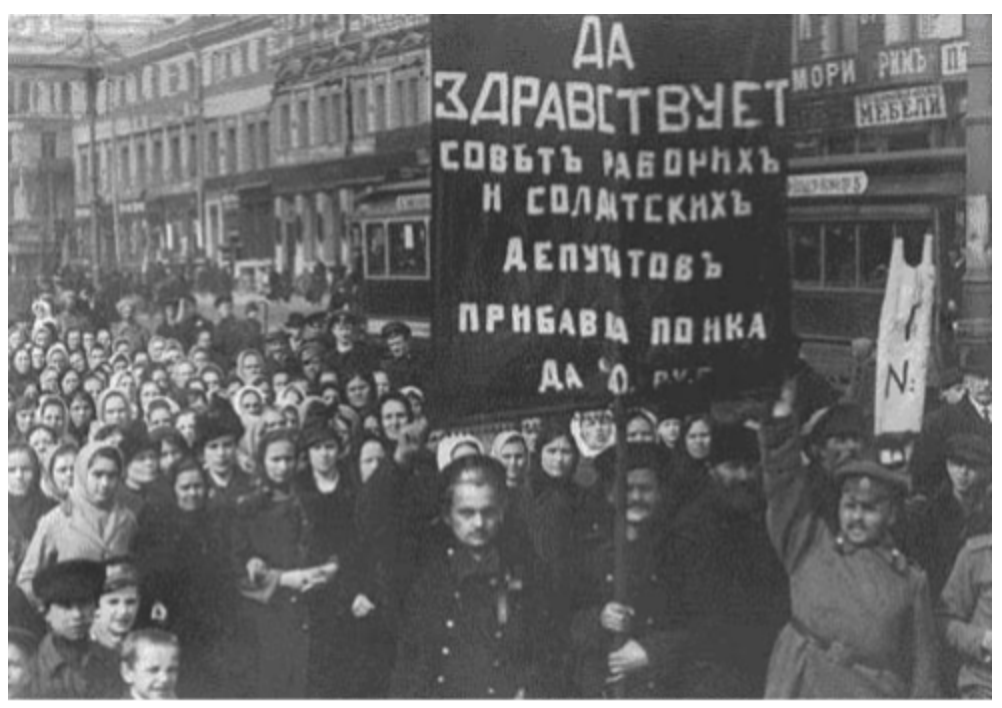
Protesters during the March Revolution, 1917.