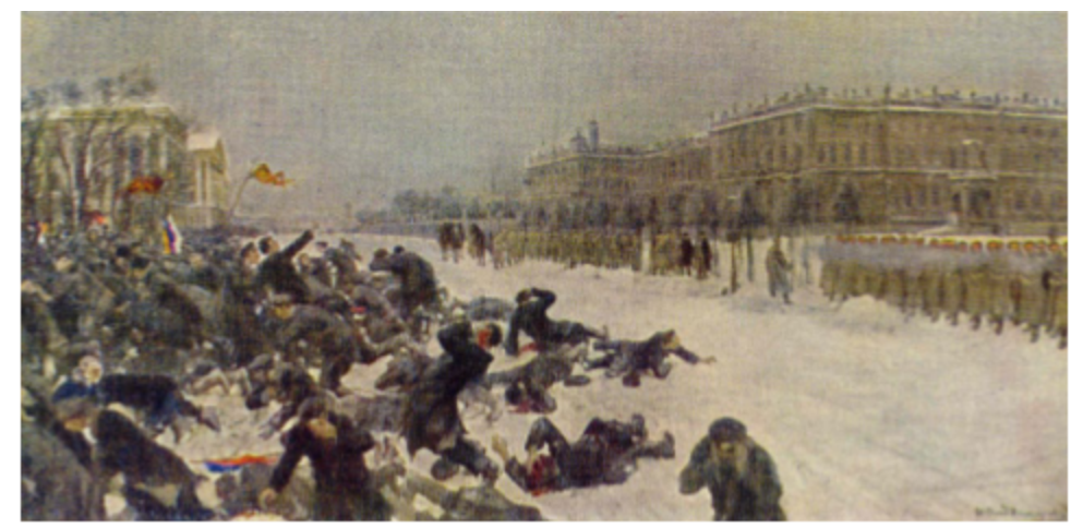
Painting commemorating Bloody Sunday created before 1917.

1904 was a bad year for Russian workers. Prices of essential goods rose so quickly that real wages declined by 20 per cent. When four members of the Assembly of Russian Workers were dismissed at the Putilov Iron Works, Gapon called for industrial action. Over the next few days, over 110,000 workers in St. Petersburg went out on strike.