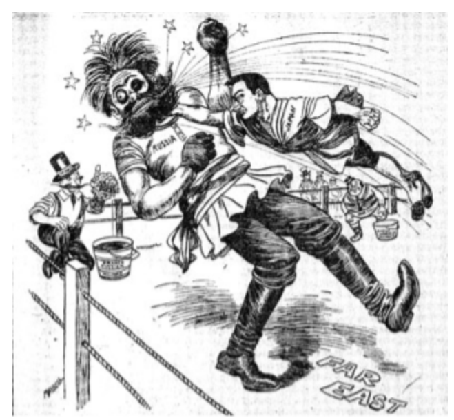
Political cartoon that depicts Japan beating Russia in the Russo-Japanese War published in the Brooklyn Eagle in 1904.

Source: http://www.indigna.edu/-iia1915/war.html