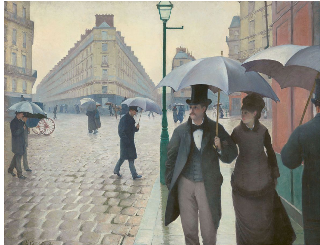
Paris Street; Rainy Day by Gustave Caillebotte