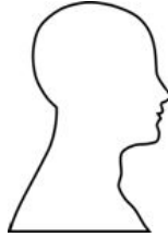
Hong Xiquan (pg. 686)